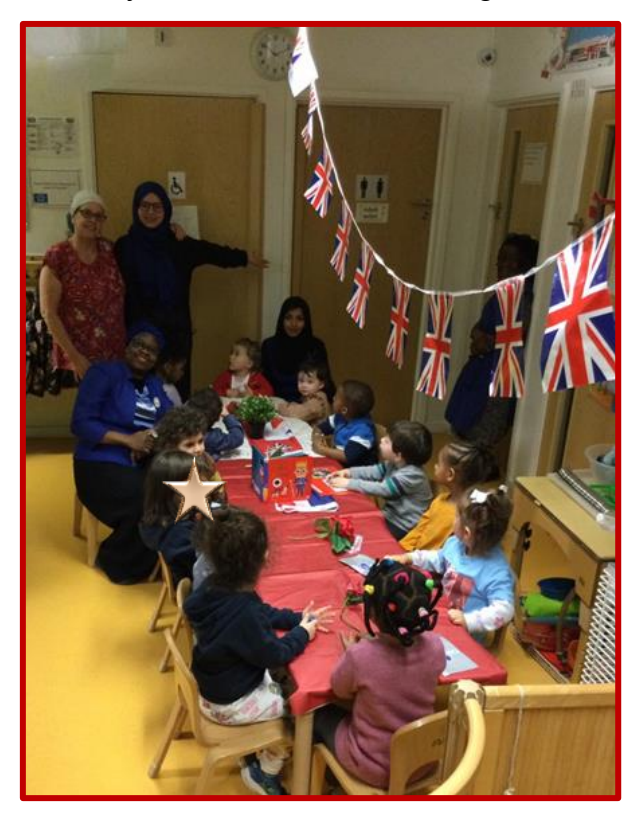
Our Kings Coronation tea party celebration