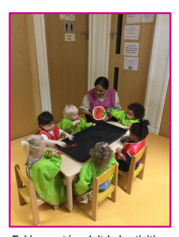
Taking part in adult-led activities.