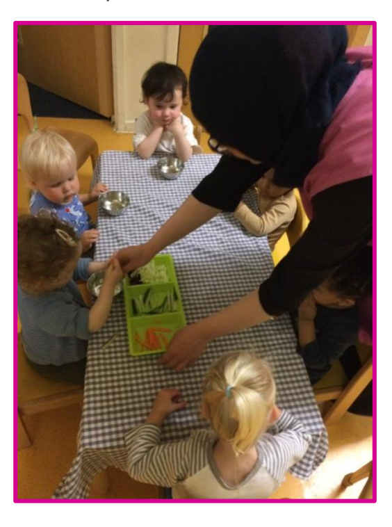
Independently serving our salad.