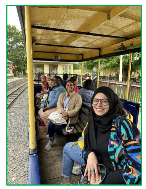
Exploring the variety of Zoo animals